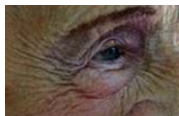
Divorced for Being "Too Old" - See Her Revenge Makeover Beautiful Aging