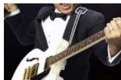
Emmys Insider 2010 By Adrienne Papp | Spotlight Media Productions