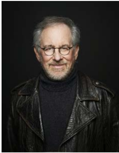
Steven Spielberg Caucus Producers Award Nominee