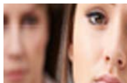
Worried about a Smoking Teen? teensmokingstudies.com