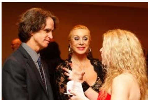
Jay Roach, Winner of Directors Honors, Three time Emmy Winner, Director of Meet the Parents, Meet the Fockers, Austin Powers Movies and many more