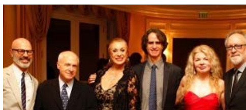
Attendees of the 30th Annual Caucus Awards Dinner, 2012

Iconic producer Gale Anne Hurd , president of Valhalla Entertainment , which created AMC's smash hit The Walking Dead , was presented the Caucus Chair's Award. "Hollywood may have been in my blood," said Hurd, "but mine was a long obstacle-strewn road from the San Fernando Valley." Hurd began her career as Roger Corman 's executive assistant and then become Head of Marketing for New World Pictures. Her production career took a stratospheric leap when she co-produced The Terminator . She followed that huge breakthrough with blockbuster hits Aliens , The Abyss and Terminator 2: Judgment Day . Hurd's additional credits include Armageddon , Hulk , Aeon Flux , The Punisher , the Academy Award-winning The Ghost and the Darkness and most recently The Waterdance .