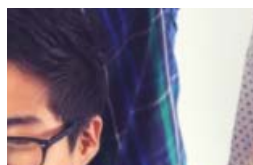
Spotlight Media Productions