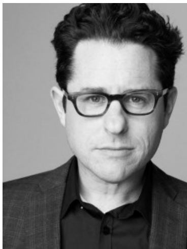
J.J. Abrams, film and television producer, screenwriter, director, actor, and composer, well known for working with Steven Spielberg, nominee of Caucus Producers Award

Office Hits, including The Terminator, Aliens, The Abyss and the Drama Series, The Walking Dead