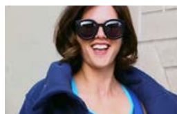
Top items You Need to Hit the Gym in Style Old Navy