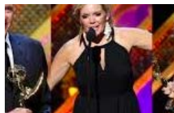
Inside the 2015 Emmy Awards