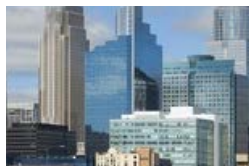
Out And About In Minneapolis Columbia Sportswear Blog