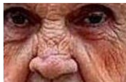
Cheating Husband's Jaw Dropped When He Saw Her Revenge Makeover NewBeauty