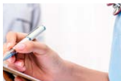
How To Tell If Your Health Benefits Aren't Measuring Up Anthem