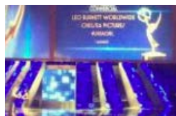
Inside the 2015 Emmy Awards