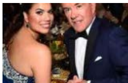
Inside the 2015 Emmy Awards