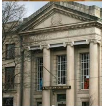
25 BEST AMERICAN GALLERIES, 2014